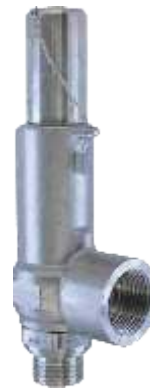
SS Safety Valve