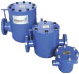
Rotating Plug Float Trap