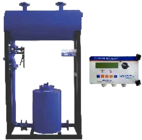
Condensate Recovery System