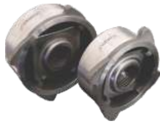
Non Return Valve