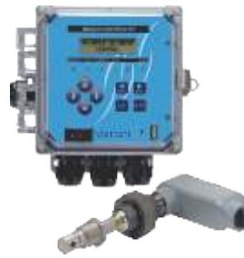
Auto Boiler Blow down System