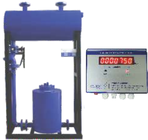
Condensate Recovery System