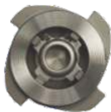
Non Return Valve