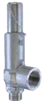
SS Safety Valve