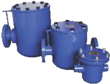
Rotating Plug Float Trap