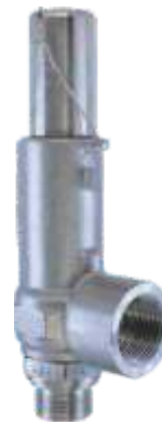
SS Safety Valve