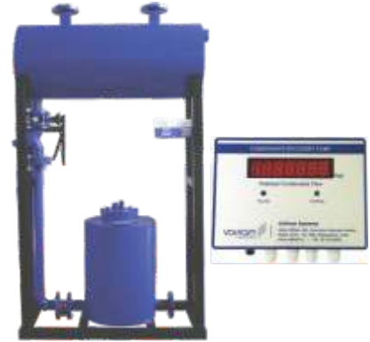
Condensate Recovery System