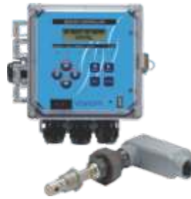
Auto Boiler Blow down System